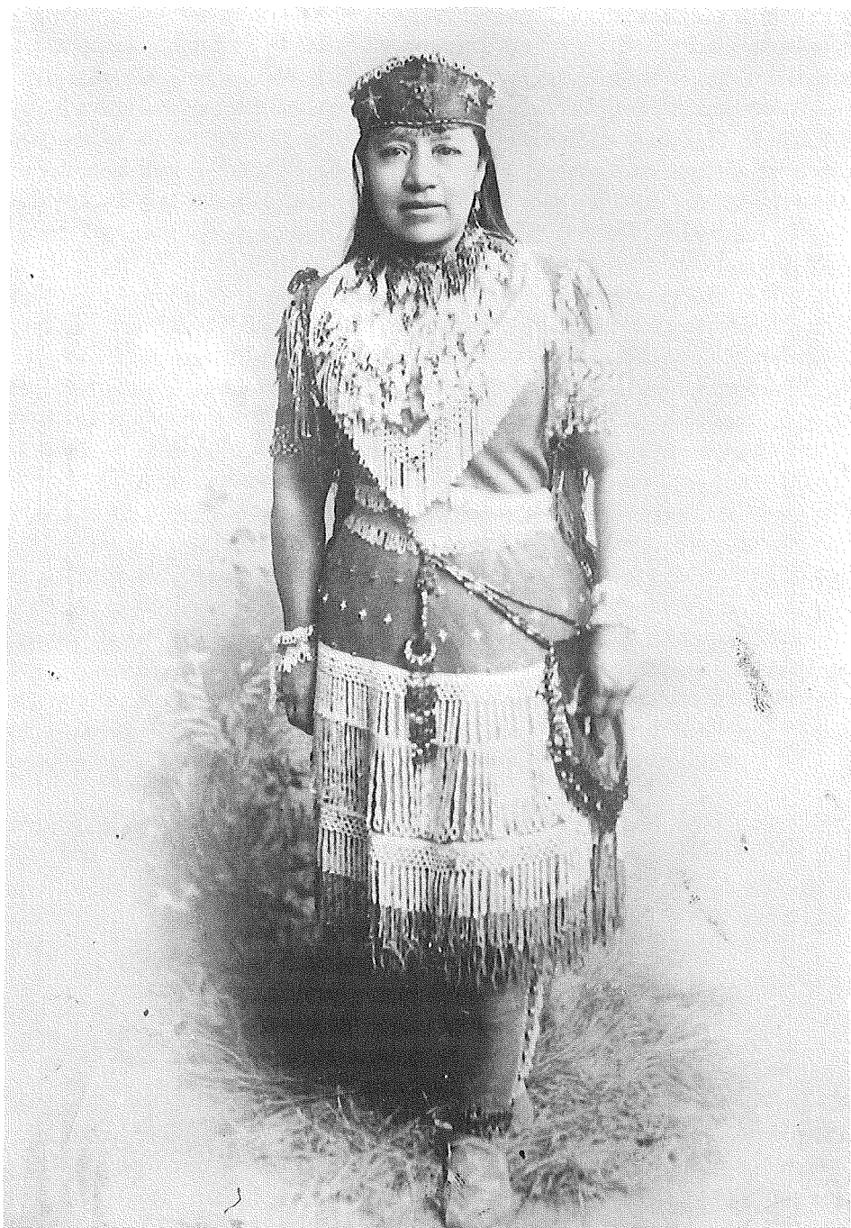
Sarah Winnemucca.