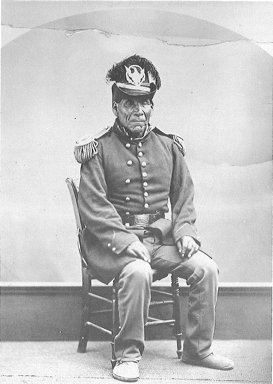
Chief Winnemucca of the Northern Paiutes.