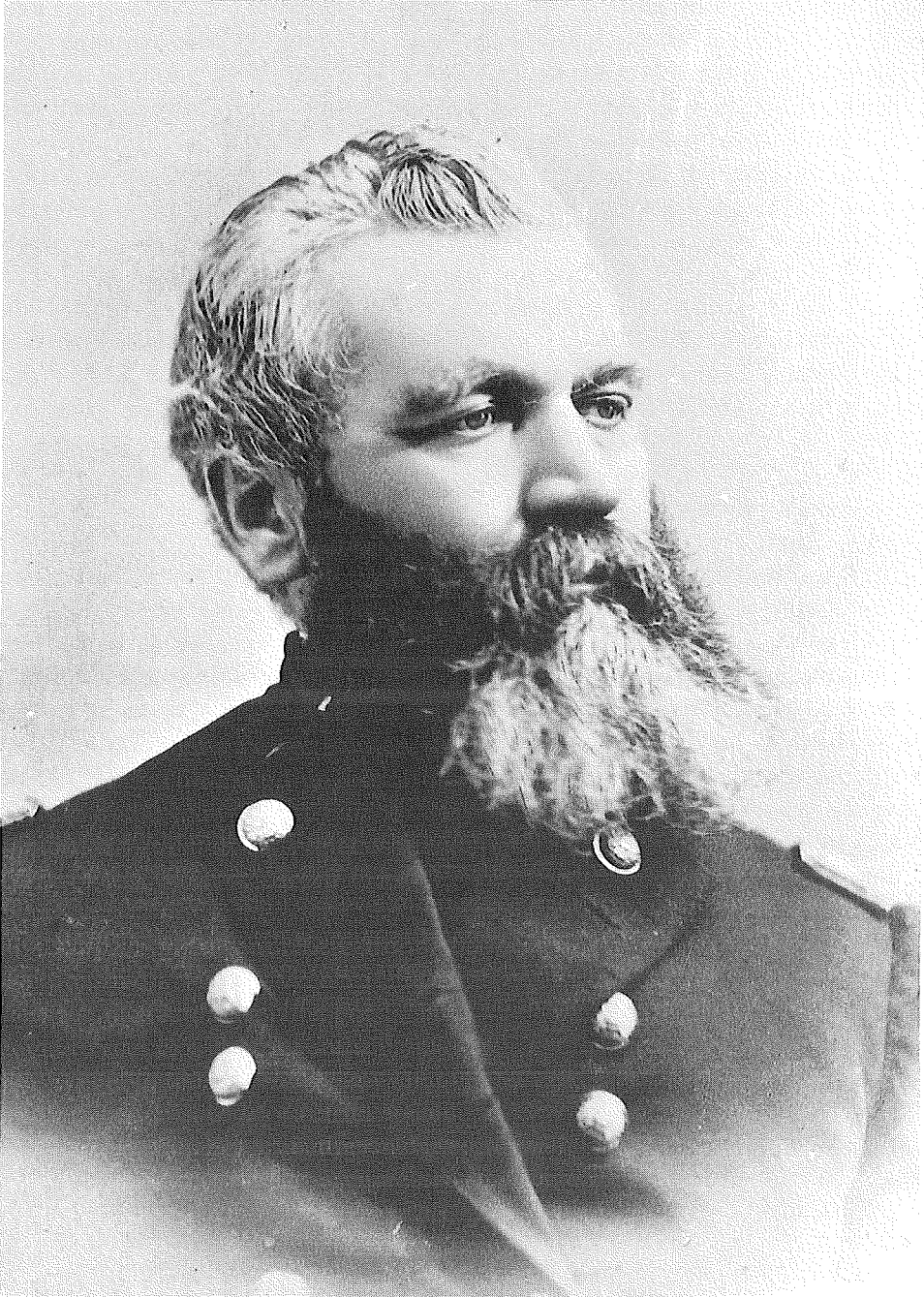
General O. O. Howard, Commander of the Military District of the Columbia.