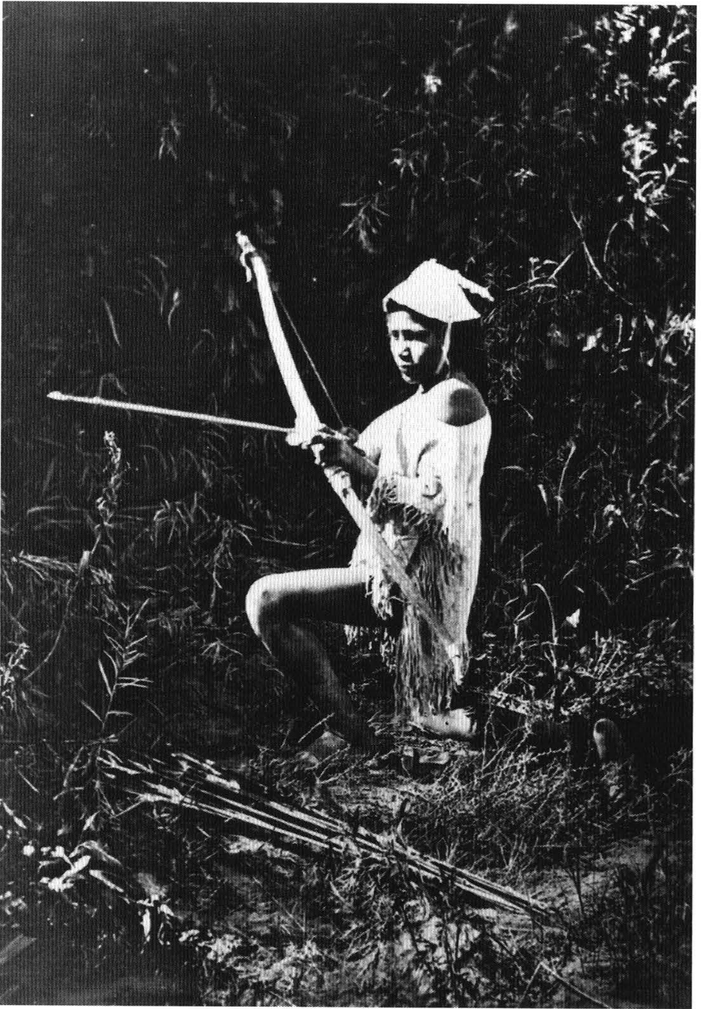
Agriculture and plant gathering likely suffered from the death of women, who were responsible for these activities.