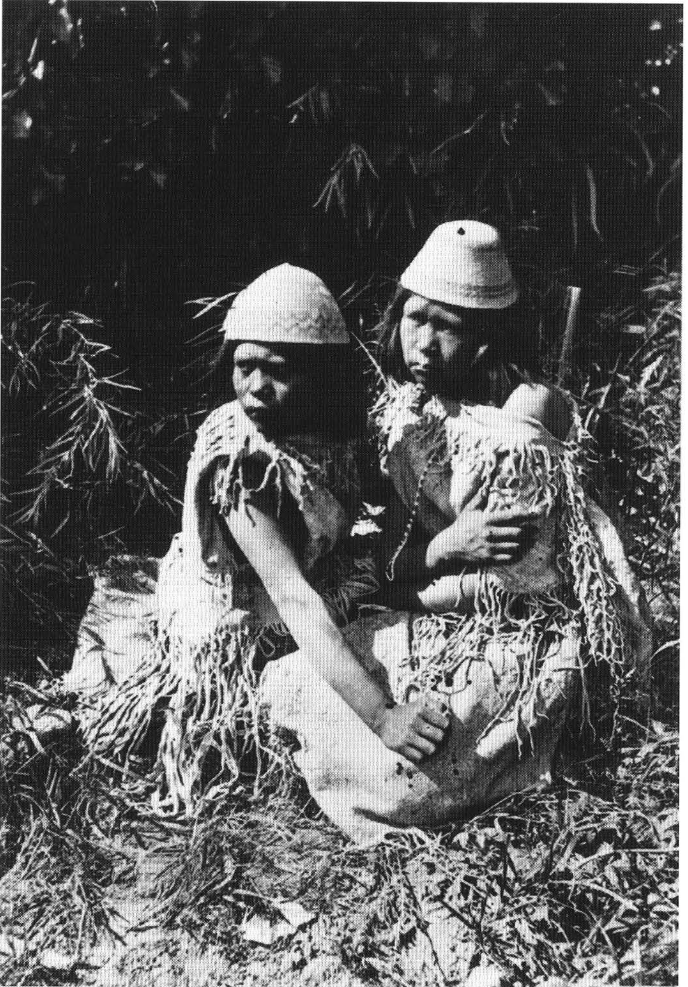
New Mexicans, Utes, Mormons, and Paiutes contended for possession of Paiute children, the preferred target of slavers.