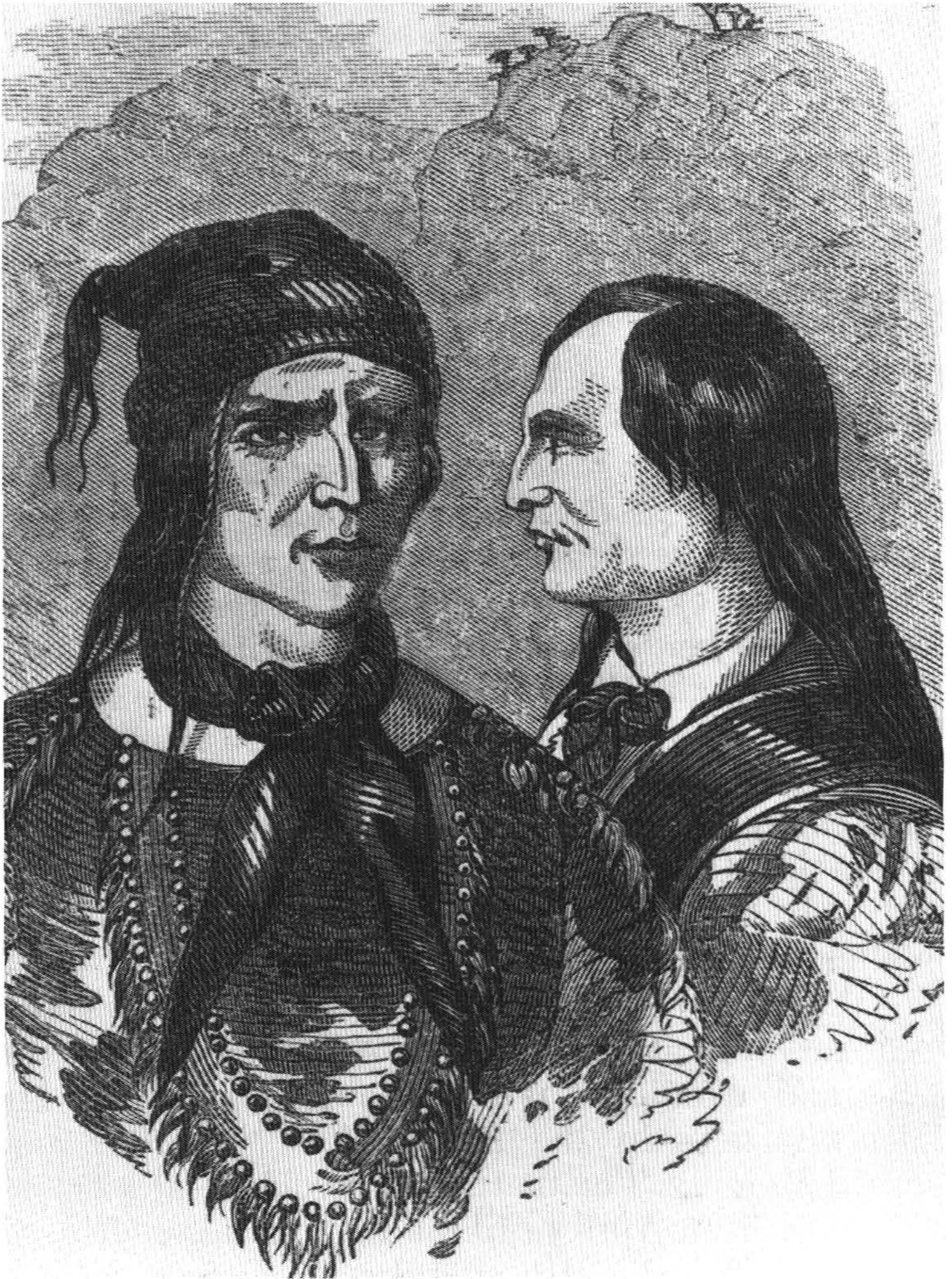
Waccara, called "The Hawk of the Mountains," led the most feared and dangerous slave raiders, a band of Western Utes who augmented horse raiding and buffalo hunting by demanding children from the Paiutes along the Spanish Trail.