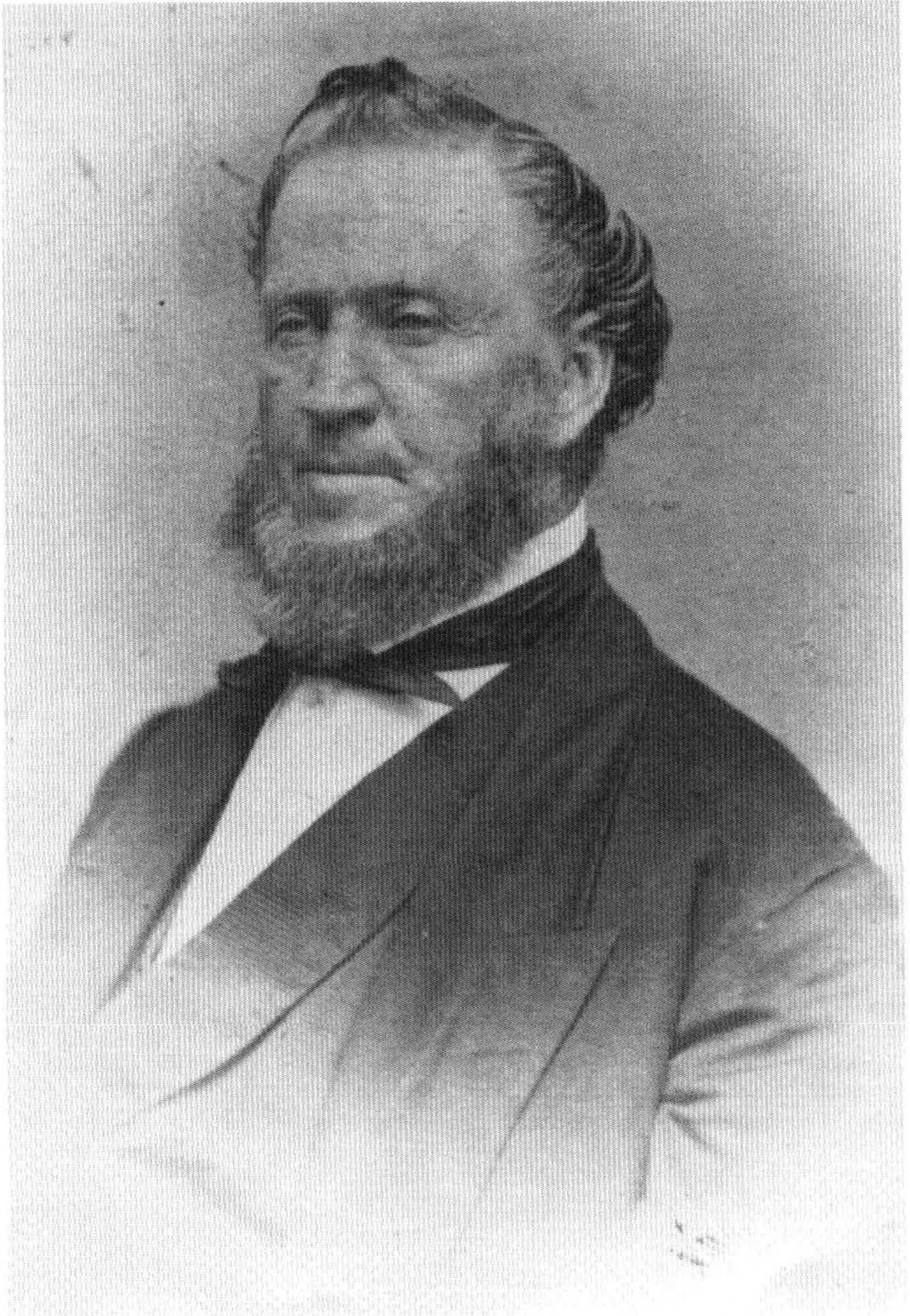
Brigham Young, leader of the Mormons, selected Salt Lake Valley for the first settlement as it was the site least likely to provoke hostilities with the natives. Of foremost importance to Young and the Mormon leadership was the securing of a safe new home for their people.