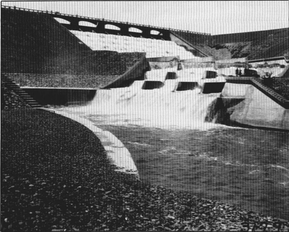
Completed in 1915, Lahontan Dam formed a reservoir to store waters of the Truckee and Carson rivers for use on the lands of the Newlands project.