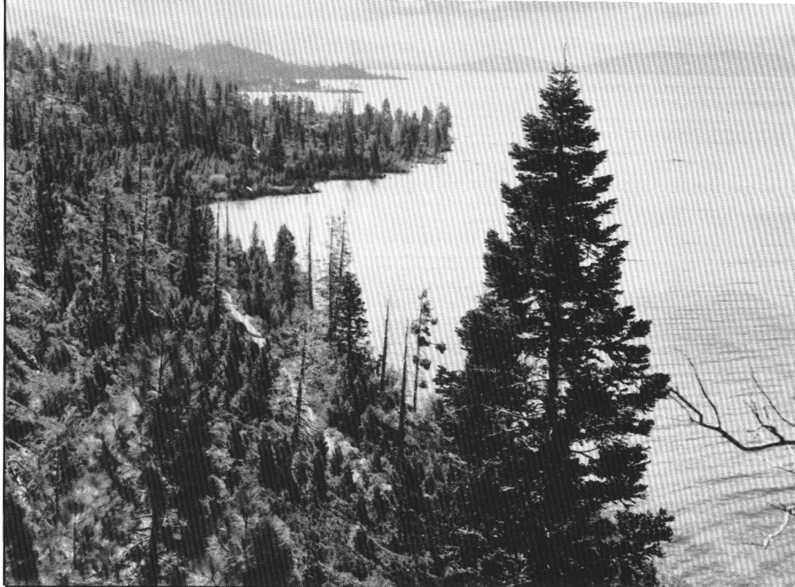
Lake Tahoe, the source of water for much of northern Nevada.