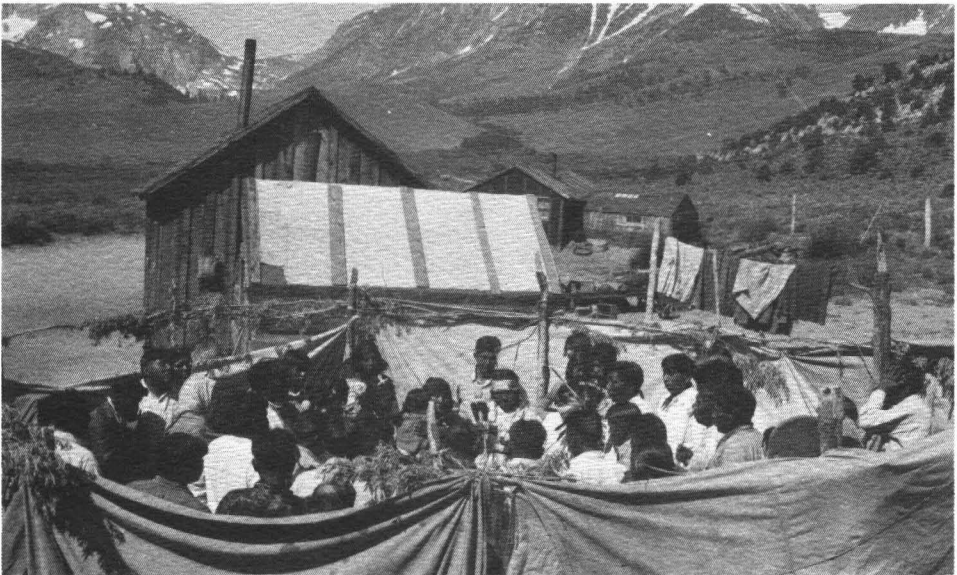
Around the Peyote altar at the end of a Peyote meeting, Mono Lake, 1938. After the midnight recess, all members took their individual fans and gourd rattles and shook them in unison with the leader of a hymn.