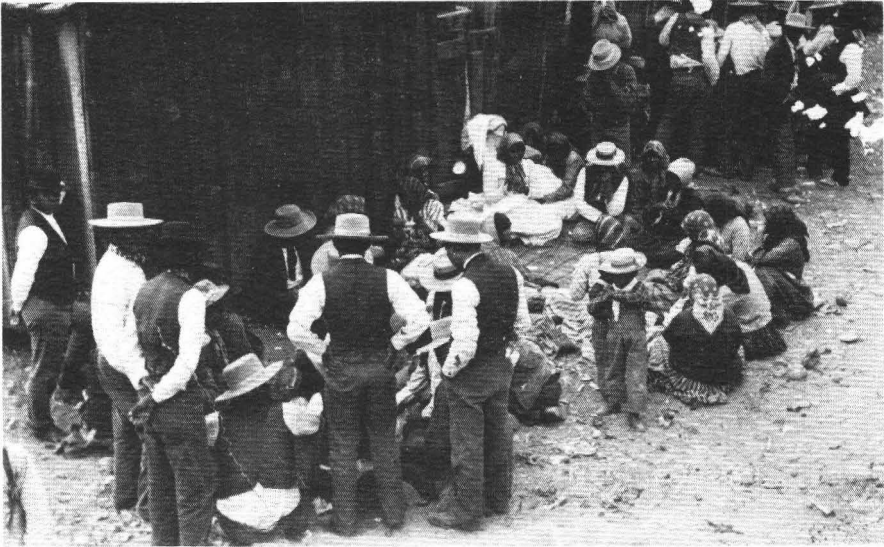
Indians gambling in downtown Reno.