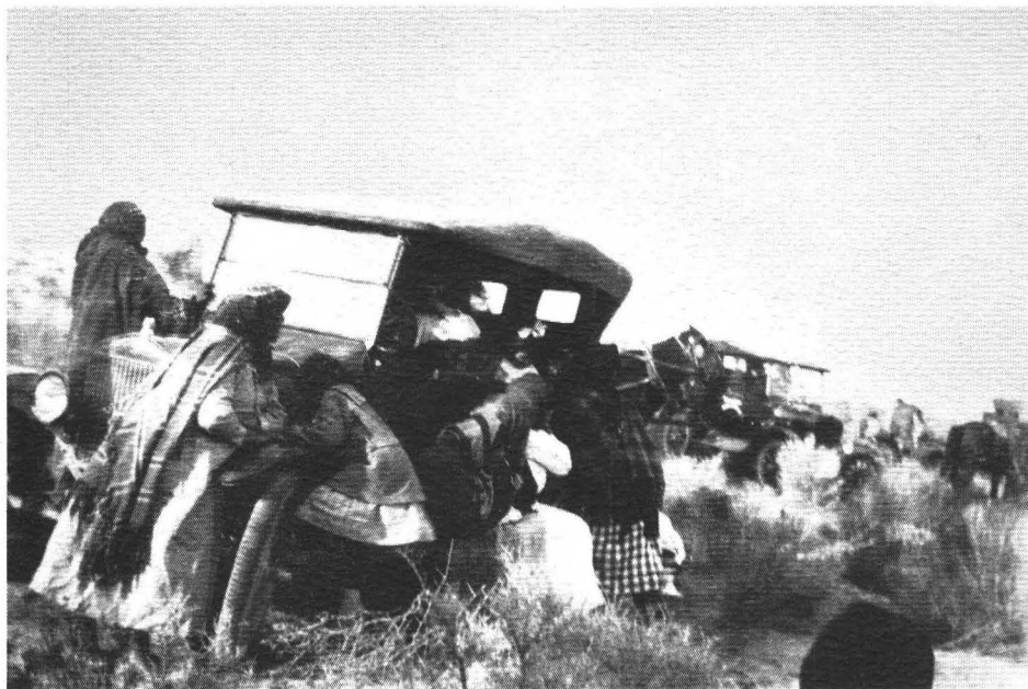
These two photographs are both probably from the Stillwater Indian Reservation, in the early 1920's. Clayton Sampson identifies the bottom picture as possibly an Indian rodeo.